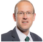
Llyr Gruffydd MS Plaid Cymru