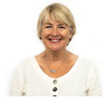
Siân Gwenllïan MS Plaid Cymru