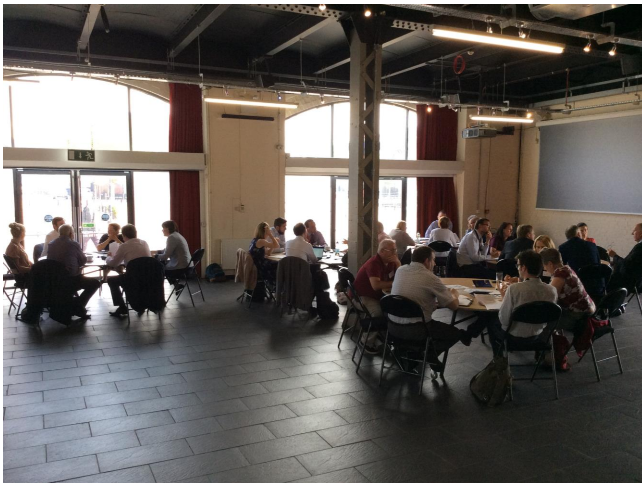
Picture: Stakeholder engagement event held in Swansea in June 2018

18. In 2020, a digital approach was implemented via polls and surveys due to the COVID-19 restrictions.