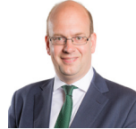
Mark Reckless MS Abolish the Welsh Assembly Party